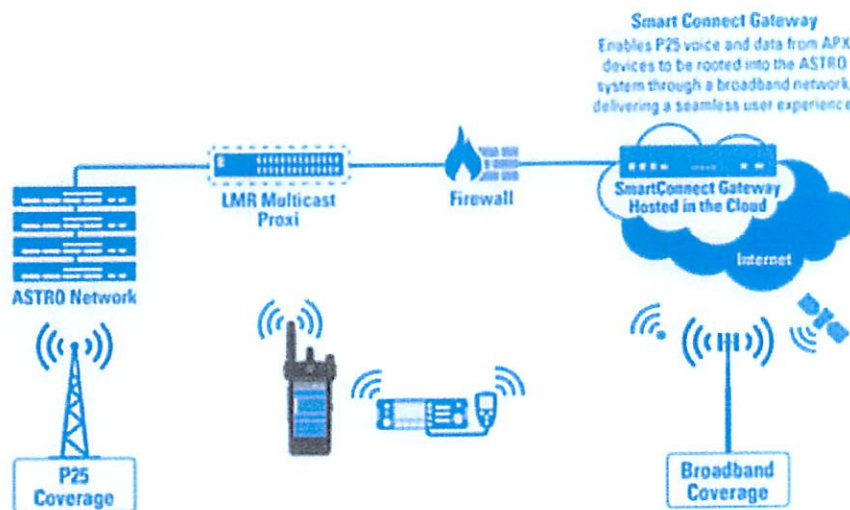
Figure 3: APX N70 SmartConnect Network Elements